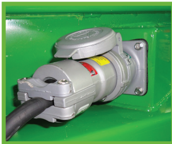
Electrical plug in