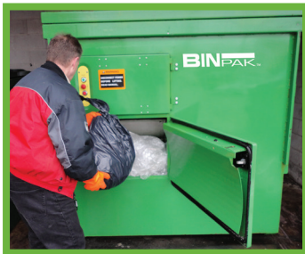
Loading is fast and easy through the large fill door