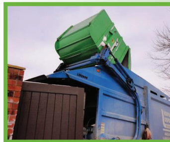
Garbage truck emptying BinPak®

BinPak® compactors are the cost effective waste management solution that combine clean, 'green' benefits with the latest innovation in waste and recycling.